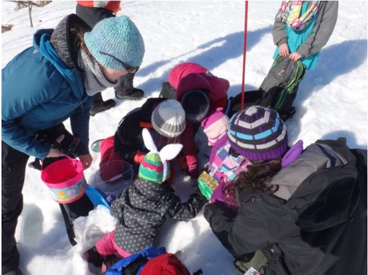
Beacons & Eggs Program at Salmon Berry Ski Hill. March 31, 2018.