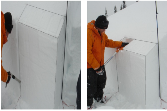
Fig. 2: Isolating an ECT column (left) and loading the column in the same manner as the compression test (right).