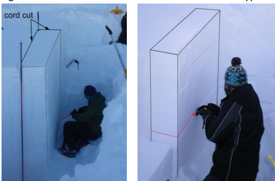
Fig. 2: Isolating a PST column (left) and saw-cutting upslope along the weak layer with the blunt edge (right).